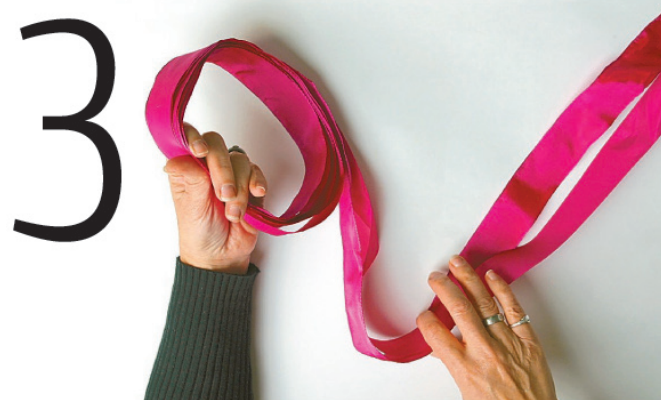
3 Anchor the ribbons in your hand and loop them evenly two to three times until you run out of ribbon, making sure not to tangle them. The loop for this bow measured 8 inches in length.