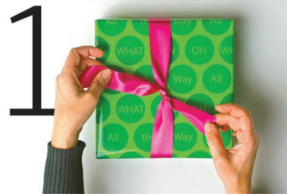
1 Tie a piece of ribbon around the package to cover the seam, knotting it on top. You also can do a more traditional criss-cross pattern, tying it together on top.