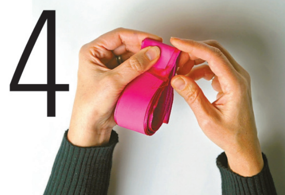
4 Fold the bow in half to measure the center; cinch the middle with your fingers.