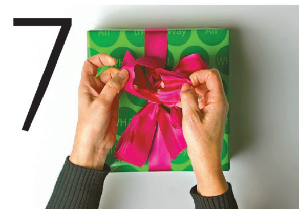
7 Fluff the bow, pulling out loops one at a time and twisting one forward then one back. Repeat. Tweak until the bow looks right.