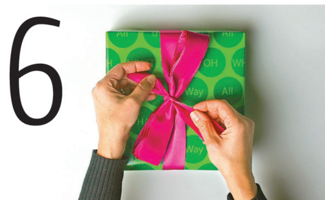
6 Tie the bow to the box with ribbon.