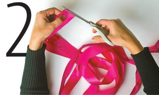
2 Set the ribboned box aside. Cut the two ribbons for the bow into 1½-yard long pieces, then match up the ends and hold them in one hand.